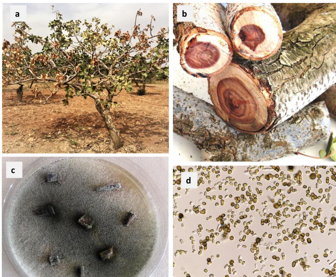
Fig. 1. Neoscytalidium novaehollandiae . a. Disease symptoms on pistachio tree, including shoot blight with scorching of leaves, branch wilt, decline and dieback, b. Brown vascular discoloration of the wood tissues of pistachio trees, c. Colony on PDA at 27 °C, d. Chains of arthroconidia and chlamydospores on PDA.

novaehollandiae from Turkey. In 2019, Neoscytalidium dimidiatum (Penz.) Crous & Slippers was reported from pistachio in Turkey (Derviş et al. 2019). This fungus is an important pathogenic organism causing wound infections, therefore posing serious threat to newly established pistachio orchards. Further studies are required to reliably determine the potential threat posed by this pathogen for pistachio growers in Turkey.