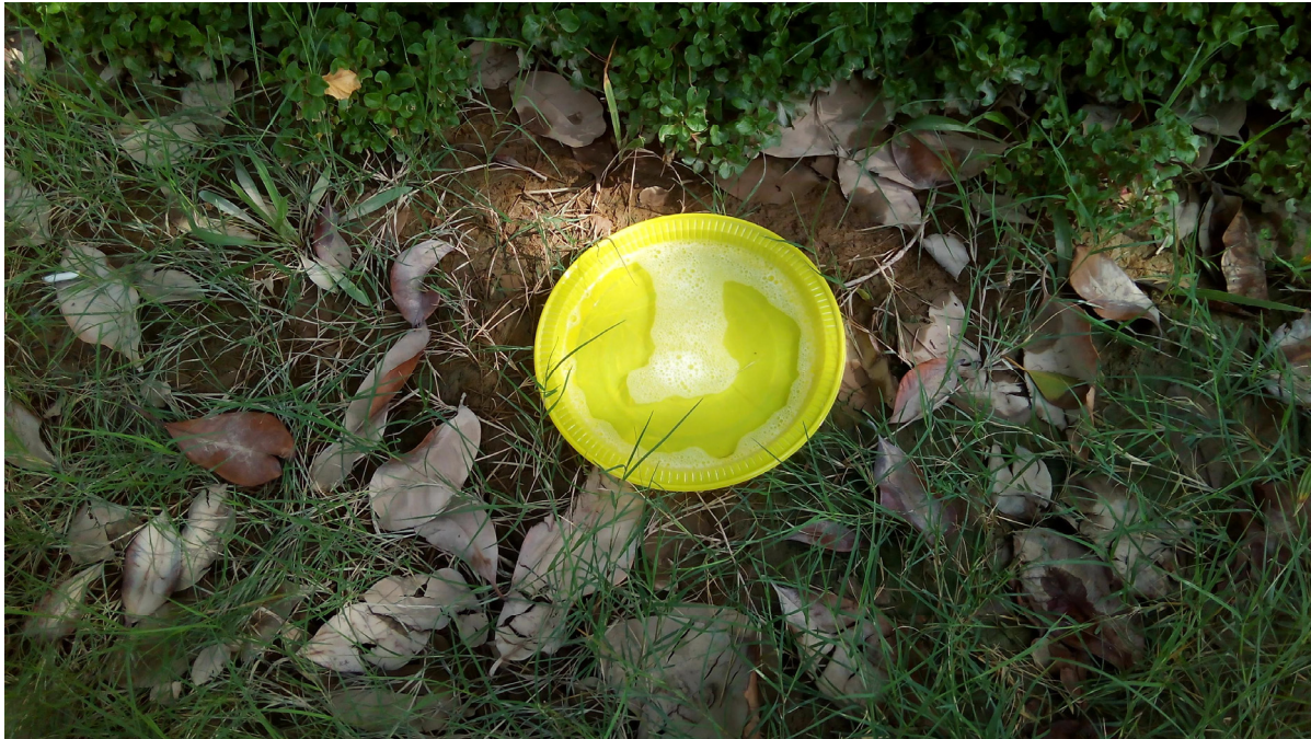
Figure 2. A yellow pan trap, by which the chalcidoids were collected.