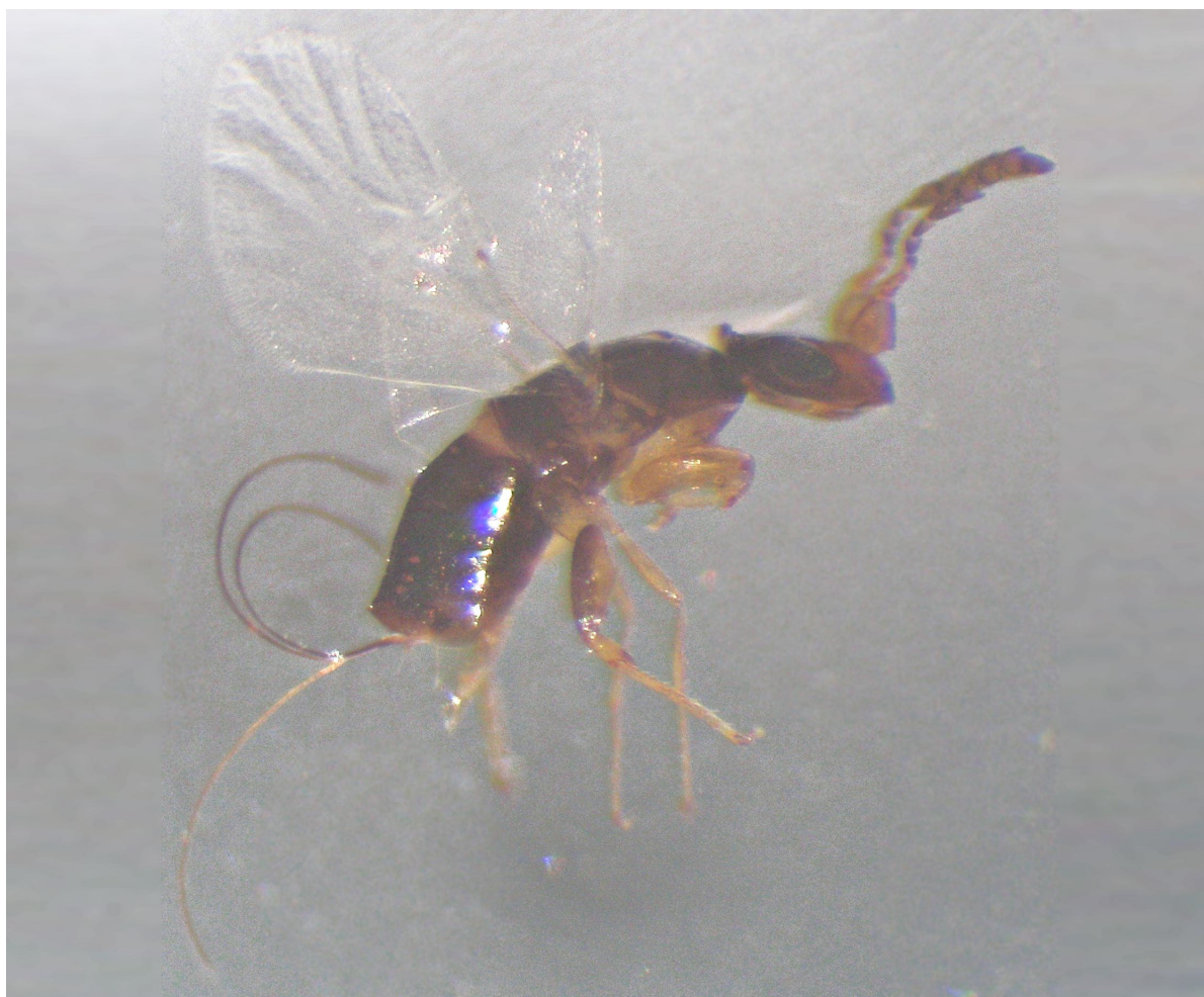
Figure 3. Female Eupristina saundersi Grandi, 1916 (40 X)

Host association in Iran: Parasitoid of Aleurocanthus spiniferus , Aleurocanthus woglumi Ashby and Bemisia tabaci (Hemiptera: Aleyrodidae) (Abd-Rabou et al. 2013).