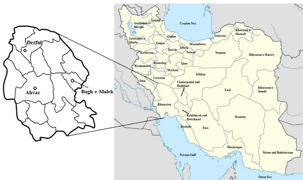
Figure 1. Map of the study area; sampling sites consist of Ahvaz, Bagh-e Malek and Dezful in Khuzestan province (southwest of Iran)