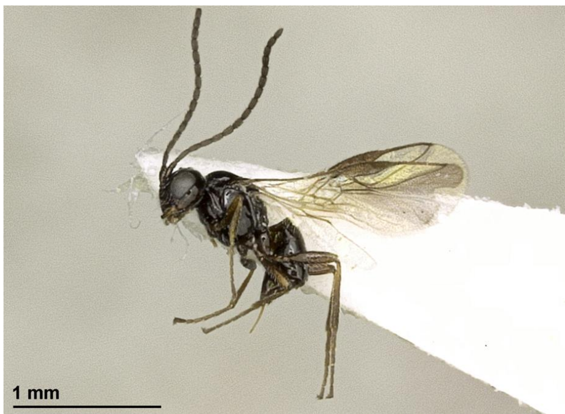
Figure 4. Phaedrotoma scaptomyzae (Fischer, 1967): habitus, lateral view (female).