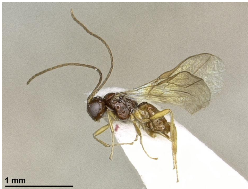
Figure 2. Opius (Cryptonastes) gracilis Fischer, 1957: habitus, lateral view (female).

Distribution in Iran: Sistan & Baluchestan ( Khajeh et al., 2014 ) and Kerman.