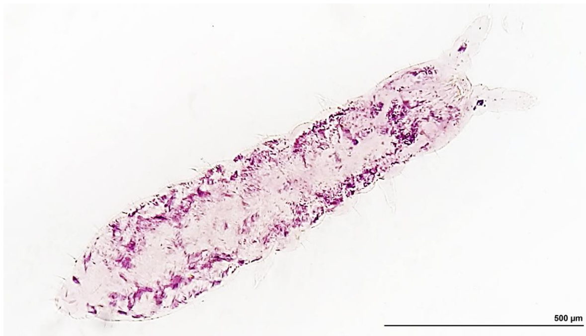
Figure 2. Friesea afurcata , General habitus.