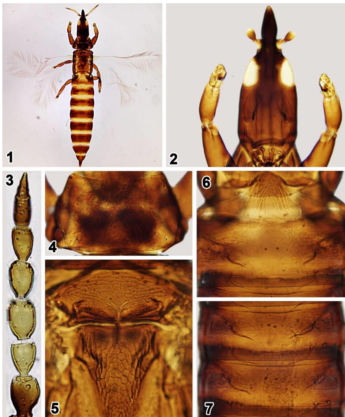
Figures 1-7. Sinuothrips hasta : 1. Female; 2. Head and fore legs; 3. Antenna; 4. Pronotum; 5. Meso and metanotum; 6. Pelta and tergite II; 7. Tergites III-IV.