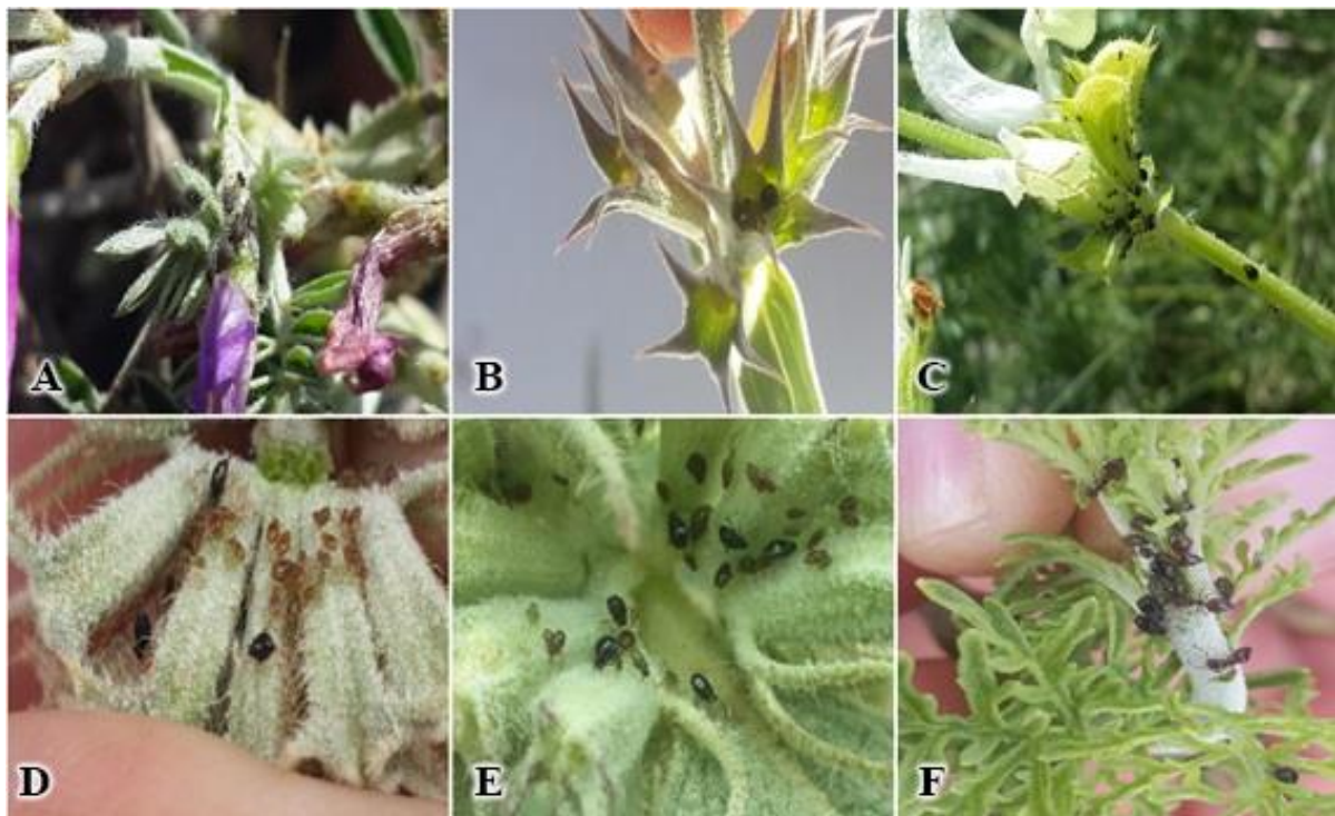
Figure 1. Brachycaudus cerasicola (Mordvilko, 1929) colonies on different parts of their host plants. A. & B. on Stachys ; C. on Salvia ; D. & E. on Phlomis ; F. on Perovskia .

Abbreviations used in the text are as follows: ANT, antennae length; ANTI, ANTII, ANTI, ANTV, ANTVIb, antennal segments I, II, III, IV, V, and the base of antennal segment VI, respectively; ANTI, III Base, basal diameter of antennal segment III; PT, processus terminalis; Rhin, Rhinaria; URS, ultimate rostral segment; 2HT, second segment of hind tarsus; and SIPH, siphunculus.