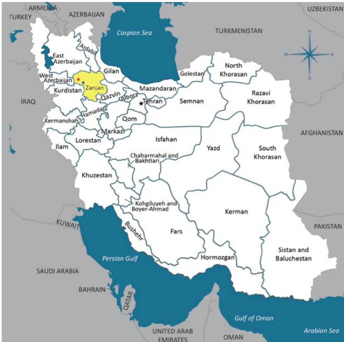
Figure 2. Representative map of Iran. Red and blue points indicate the study sites in Zanjan province.