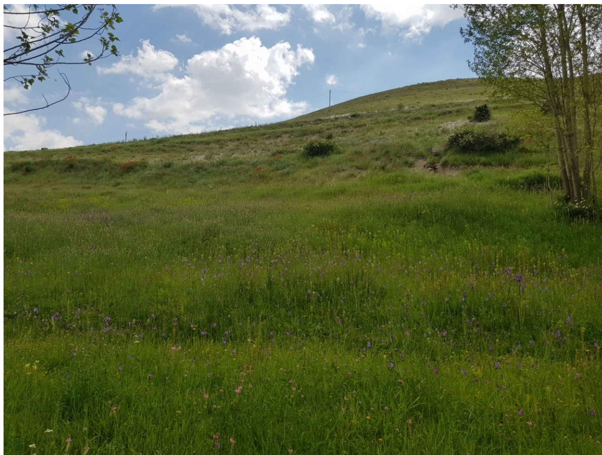
Figure 1. General habitat at Qaleh-Juq, Dandi, Mahneshan County, Iran in June 2018.

Host plants: Fragaria sp. (Çalmaşur & Özbek, 2004).