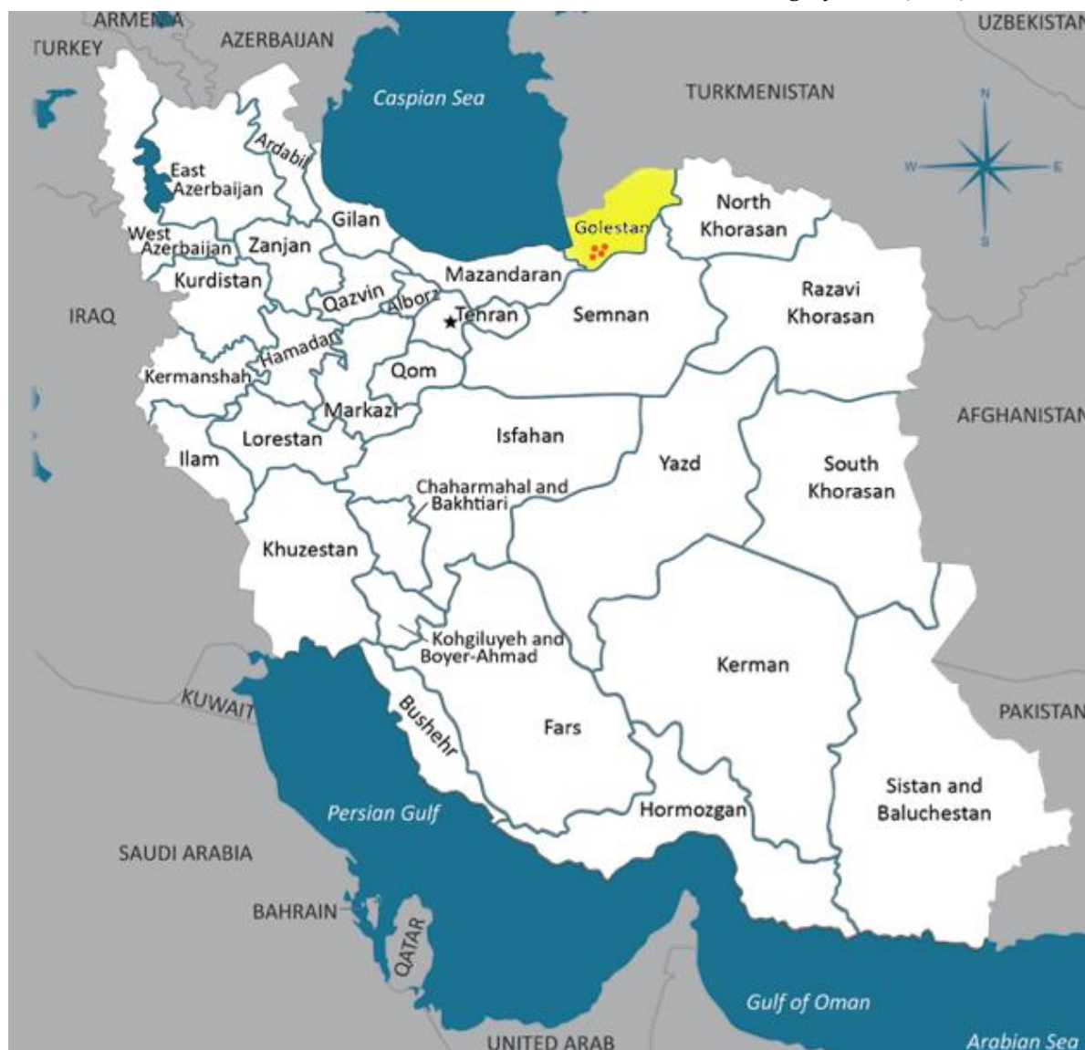
Figure 1. Geographic map of the collected species of sawflies in the North of Iran. Red points indicate the study sites of Gorgan County of Golestan Province.

A faunistic study of sawflies was conducted using specimens collected in the northern part of Iran, Golestan province, Gorgan County, during 2015-2017 (Fig. 1). All adult sawflies were captured during flight, in 16 Malaise traps. The position of capture locations was determined by a Global Positioning System (GPS).