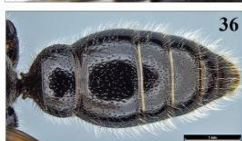
Figures 31-36. Tiphia exacta Nurse, female. 31. Body profile; 32. Head, frontal view; 33. Head & Mesosoma, dorsal view; 34. Mesosoma, lateral view; 35. Fore wing; 36. Metasoma, dorsal view.