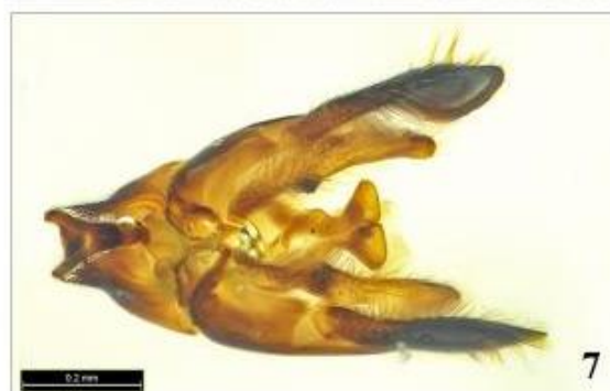
Figures 1-7. Tiphia kashmirensis Hanima & Girish Kumar sp. nov. , Holotype, male. 1. Body profile; 2. Head, frontal view; 3. Mesosoma, dorsal view; 4. Mesosoma, lateral view; 5. Wings; 6. Metasoma, dorsal view; 7. Genitalia.