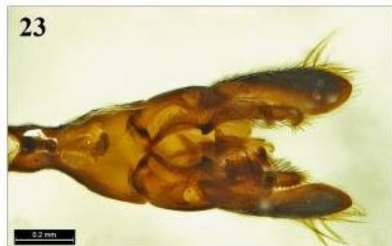
Figures 17–23. Tiphia khasiana Cameron, male. 17. Body profile; 18. Head, frontal view; 19. Mesosoma, dorsal view; 20. Mesosoma, lateral view; 21. Fore wing; 22. Metasoma, dorsal view; 23. Genitalia.