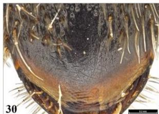
Figures 24–30. Tiphia khasiana Cameron, female. 24. Body profile; 25. Head, frontal view; 26. Mesosoma, dorsal view; 27. Mesosoma, lateral view (Arrow mark indicates rugae on lateral side of propodeum); 28. Fore wing; 29. Metasoma, dorsal view; 30. Pygidium.