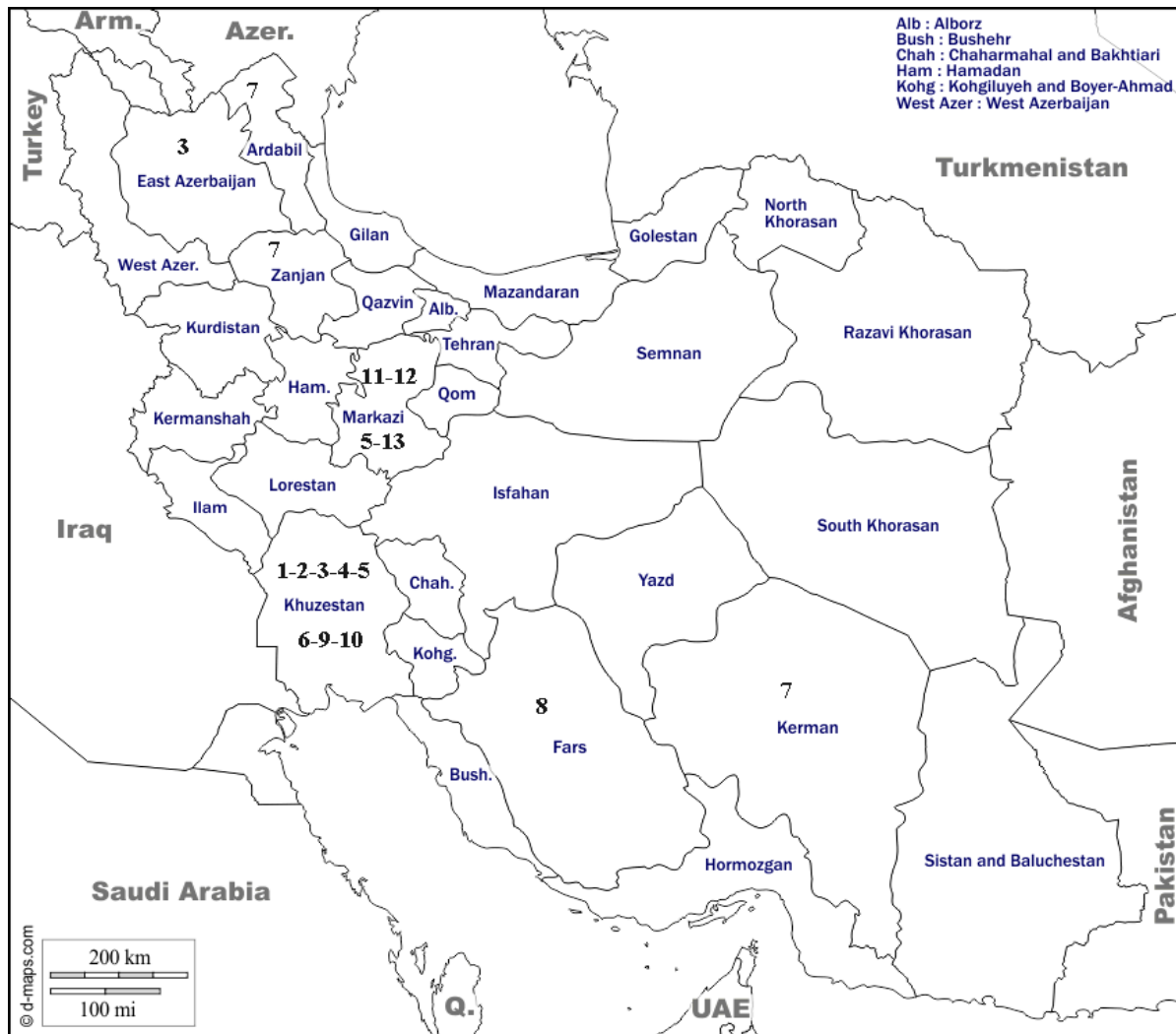
Figure 2. Map of Iran with collection localities of the studied specimens. 1. Pseudovipio tataricus (Kokujev, 1898); 2. Cardiochiles pseudofallax Telenga, 1955; 3. Heterospilus rubicola Fischer, 1968; 4. Polystenus rugosus Forster, 1862; 5. Rhaconotus aciculatus Ruthe, 1854; 6. Spathius polonicus Niezabitowski, 1910; 7. Macrocentrus collaris (Spinola, 1808); 8. Macrocentrus turkestanicus (Telenga, 1950); 9. Biosteres spinaciaeformis Fischer, 1971; 10. Utetes fulvicollis (Thomson, 1895); 11. Rhyssalus longicaudis (Tobias & Belokobylskij, 1981); 12. Aleiodes seriatus (Herrich-Schaffer, 1838); 13. Aleiodes arcticus (Thomson, 1892).