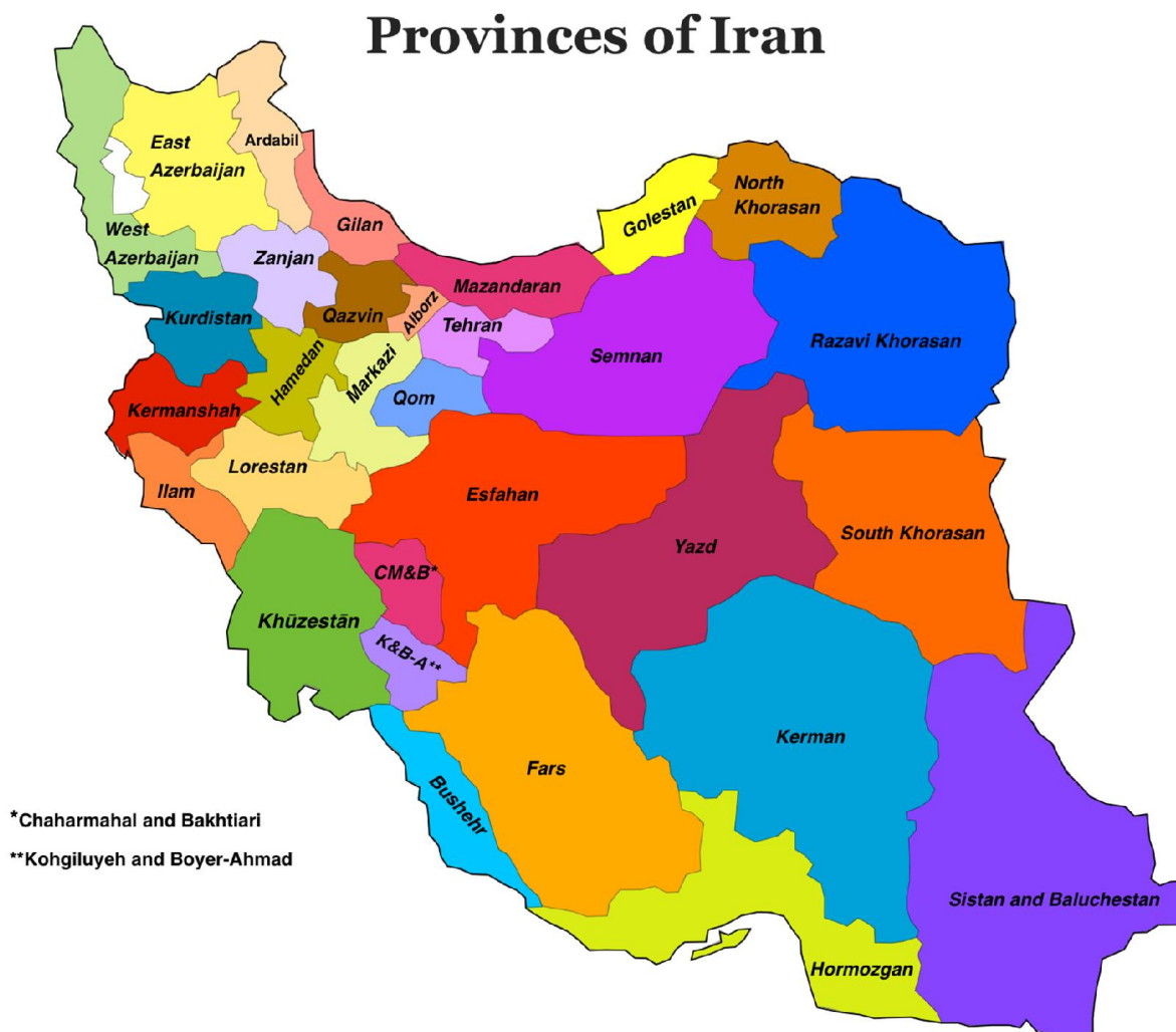
Figure 1. A simple map of Iranian provinces.

In addition to the species not included in the study of Kazemi and Rajaei (2013), during five years (2013–2018) the list of mesostigmatic species reported from different parts of Iran were increased into 533, which is the results of existing a great deal of variability in Iran's topography, temperate climatic zone, geological and geomorphic structure, as well as climate. Overall, a total of 371 species out of 127 genera belonging to 39 families are listed.