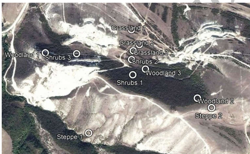
Figure 1. Map of soil sampling locations on Saskhori quarries.

For oribatid mites, we sampled three subplots per habitat, for degraded steppes two subplots were sampled (Table 2, Fig. 1). Degraded steppes represent small, heavily damaged, less calcareous part of perennial grassland; so that in total, we had more samples from grassland areas, than from other habitats. In each subplot, four samples (soil core of 10cm 3 ) were collected from March to October of 2017. Soil samples were labeled, taken in the laboratory and invertebrates were extracted during one week using modified Berlese-Tullgren extractor. Extraction was performed for 24 hours and individuals were stored in 70% ethanol. For species determination, temporary cavity slides were prepared using lactic acid. Only adult individuals were identified to species level. For identification of oribatid mites, keys of Ghilarov and Krivolutsky (1975) and Weigmann (2006) and for identification of mesostigmatic mite keys of Ghilarov and Bregetova (1977) and Karg (1993) were used. Voucher species were stored in the collection of the Agricultural University of Georgia. For oribatid mites, we followed family classification and nomenclature of Schatz et al. (2011) and for mesostigmatids – family classification and nomenclature of Lindquist et al. (2009). The diversity indexes were calculated using PAST and according to Magurran (2004).