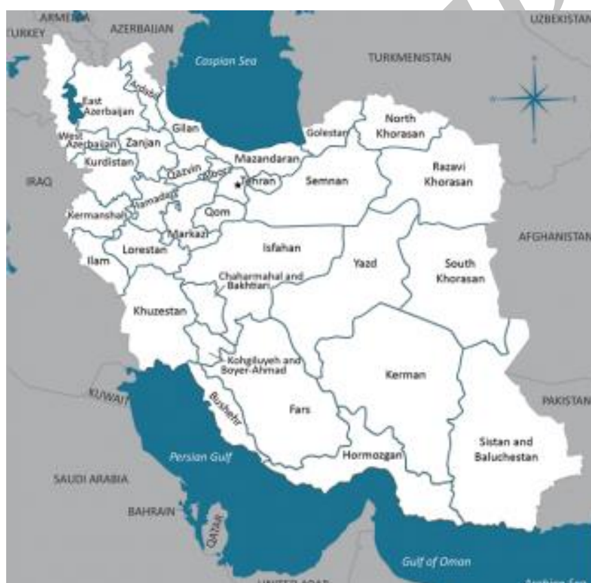
Figure 1: Map of Iran and the provinces' positions.

Several data sources were used to estimate the cross-country above-ground biomass carbon content in the country. For this purpose, data of the rangelands' total area and each class area (Table 2) per province and annual rangeland productivity (drymass kg ha -1 ) were extracted from the Agriculture Statistical Pocketbook national annual report published by the Ministry of Agriculture Jihad, Iran from 2006 to 2013.