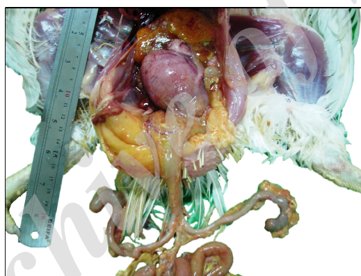
Figure 2. Calcified shell egg present in the left oviduct

Two normal ureters were present. The left ureter was opening in the dorsal wall of the left vent urodeum and the right ureter was opening to the right vent, respectively.