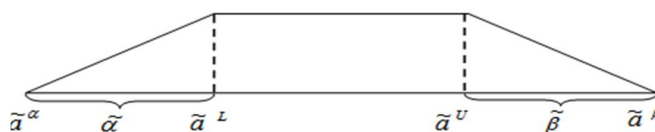
Fig 2. Trapezoidal fuzzy number