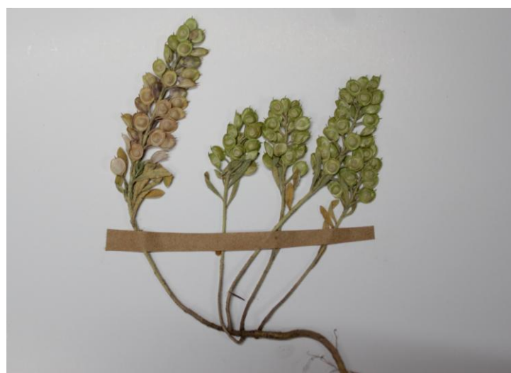
Fig. 1. Plant on sheet of Herbarium ( A. mazandaranicum ).