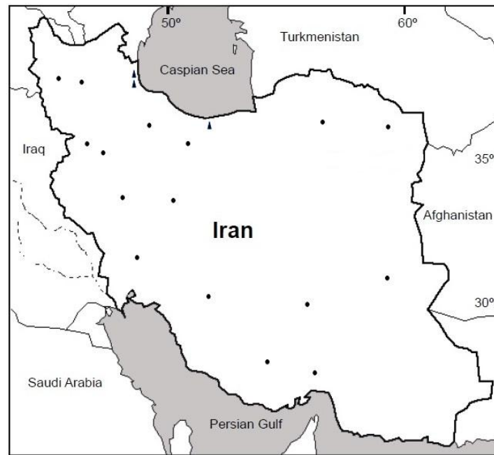
Fig. 3. Distribution of Alyssum szowitsianum (●) and A. mazandaranicum (▲) in Iran.