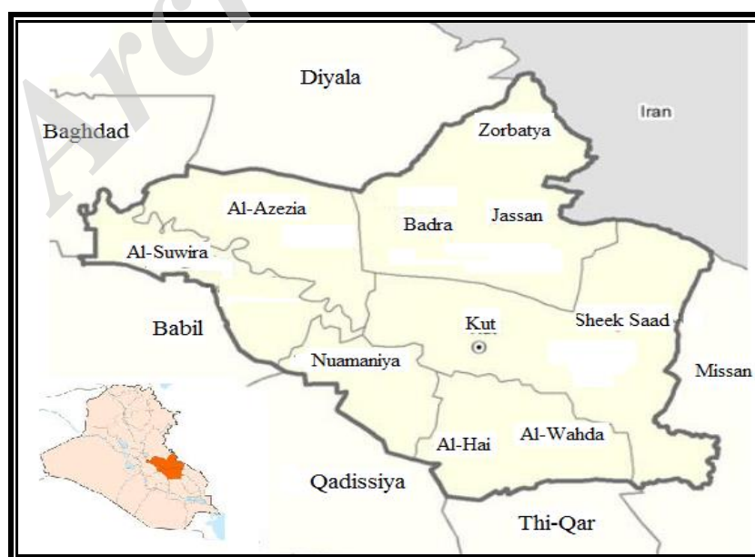
Fig. 1. Sketch map showing locations of the studied sites in Wassit governorate

Wassit Governorate is located in eastern Iraq, at the border with Iran. The Baramadad border passing through Wassit connects the two countries. Wassit shares internal boundaries with the governorates of Diyala, Baghdad, Babil, Qadissiya, Thi-Qar, and Missan (Fig. 1). It is intersected by the Tigris River, along which runs a ribbon of irrigated farmland, giving way to a dry desert landscape to the northeast. Wassit has a dry, desert climate, with its temperature easily exceeding 40^{\circ}\text{C} in summer. Rainfall is scarce and concentrated during winter months (Salim and Klis, 2010).