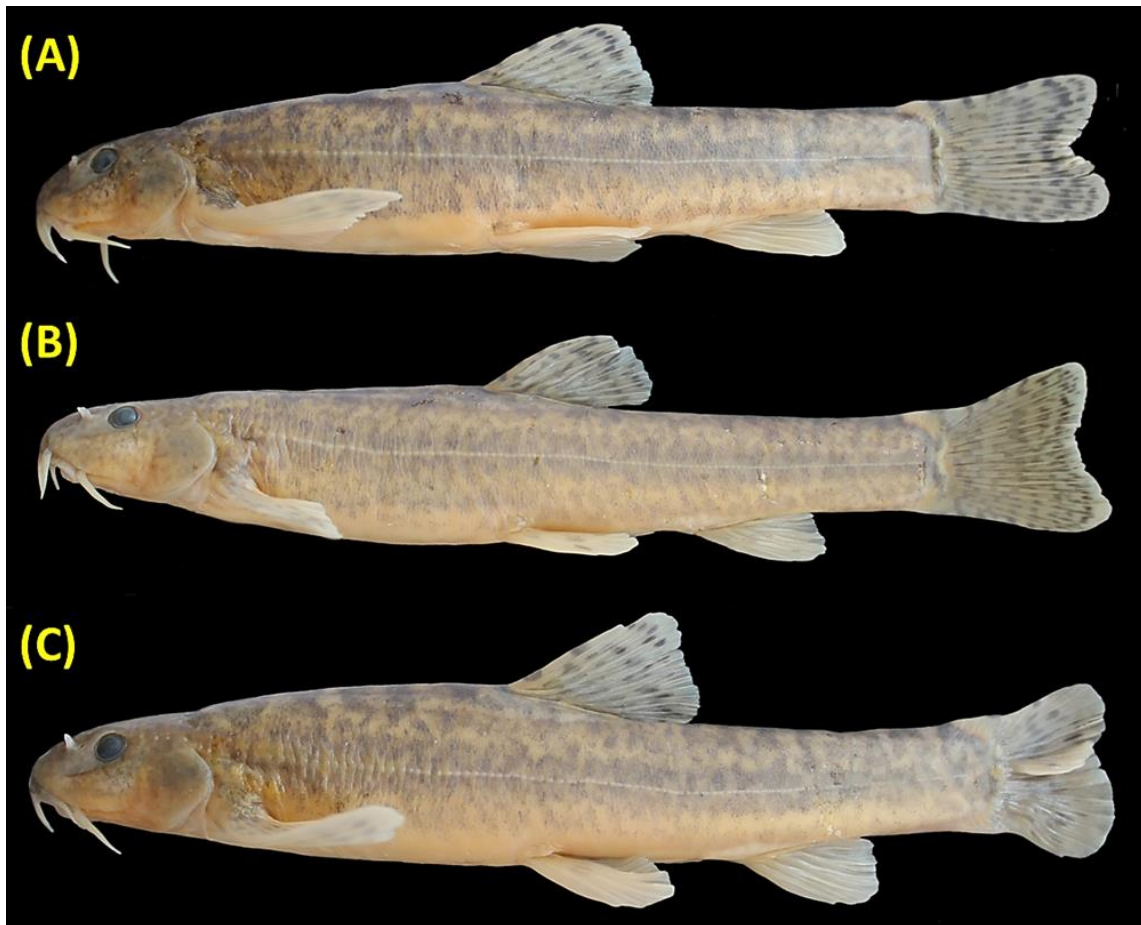
Fig.3. Oxynoemacheilus veyseli n. sp., paratypes; Turkey: Kars prov.: Bozkuş River, Caspian Sea basin. (A) NHVUIC 14005-4, 98.7mm SL; (B) NHVUIC 14005-5, 93.5mm SL; (C) NHVUIC 14005-11, 88.2mm SL.

Oxynoemacheilus veyseli is distinguished from O. brandti by having the flank with a set of mid-lateral elongated, irregular-shaped dark brown blotches, sometimes fused, interrupted by the lateral line (vs. flank with separated dark-brown bars anteriorly, and fused posteriorly on the caudal peduncle forming a mottled pattern), dorsum with three or four separated dark-brown roundish to elongated blotches predorsally and postdorsally (vs. dorsum with elongated blotches fused completely or incompletely with the flank bars), shorter pelvic fin (14.1-16.8 vs. 17.0-18.1 %SL), deeper caudal peduncle (10.2-11.4 vs. 7.2-8.7 %SL), and slightly emarginated (vs. deeply emarginated) caudal fin.