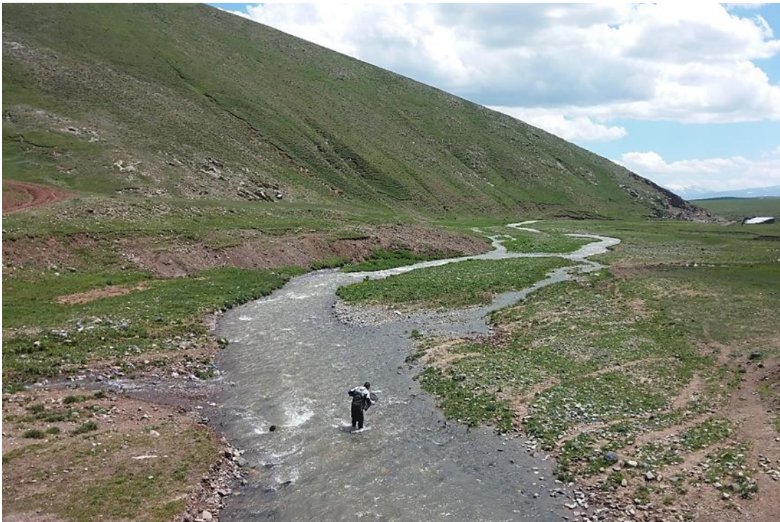
Fig.7. Type locality of Oxynoemacheilus veyseli n. sp., Turkey: Kars prov.: Bozkuş River, near Kars city, Caspian Sea basin.

lateral and three central pores in supratemporal canal. Anterior nostril opening at end of a low, pointed and flap-like tube. Mouth arched. Lower lip thick with a deep median interruption and some marked furrows in lower lip, upper lip with a small inception (not marked in some individuals). Caudal fin with 8+9 or 9+9 rays. Longest known specimen 116.8mm SL.