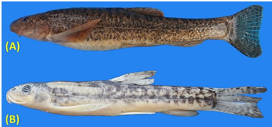
Fig.1. (A) Live specimens of Oxynoemacheilus veyseli n. sp., uncatalogued, Turkey: Kars prov.: Bozkuş River, Aras River drainage, and (B) Oxynoemacheilus araxensis NHVUIC 17006-1, 52.9mm SL, Turkey: Erzurum prov.: Karasu River at Kandilli, Euphrates-Tigris river system.