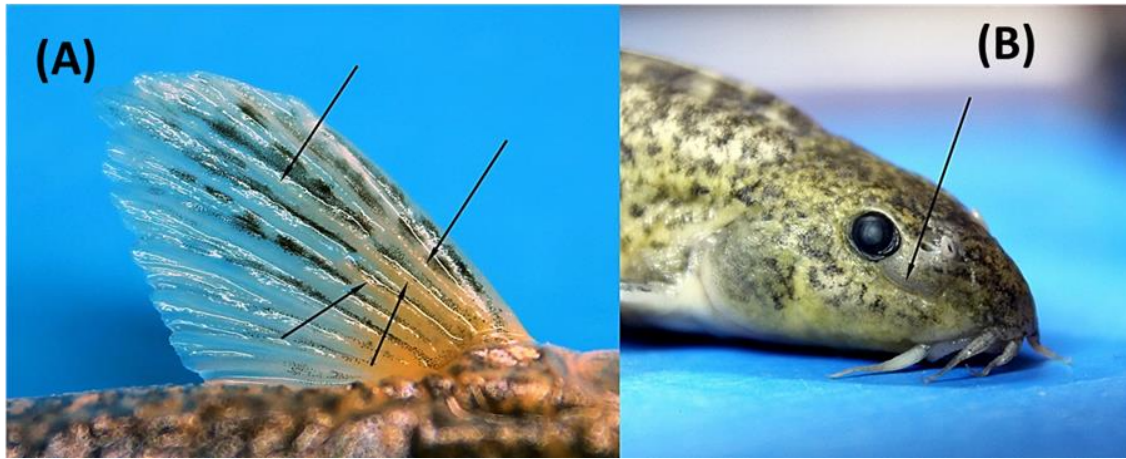
Fig.6. Secondary sexual dimorphism characteristics in the matured males (a) uncini on rays of dorsal-fin, and (b) suborbital groove.