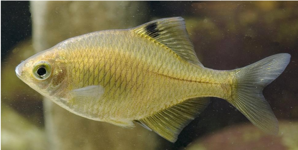
Fig.1. Rhodeus ocellatus , Hamamatsu, Shizuoka, Japan.