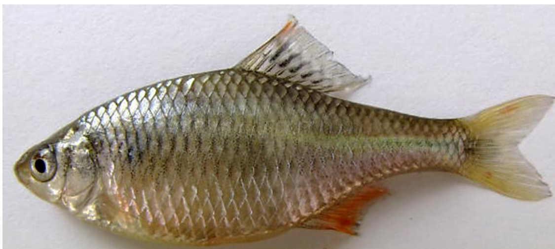
Fig.3. Rhodeus amarus , Anzali Wetland, November 2007, K. Abbasi.

in Azerbaijan; gorchak in Russian; bitterling, European bitterling].