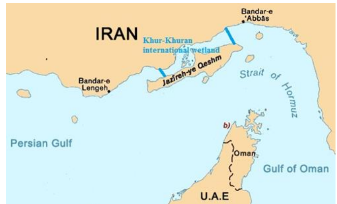
Figure 1. Location of the Khur-e Khuran International Wetland.

Study area: KIW is located between 27-00 and 26-40 north latitude, 52-55 and 55-21 east longitude and between the Khamir Port and Qeshm Island in the southern coast of Iran (Fig. 1). The area now is protected as "Hara Protected Area" managed by the