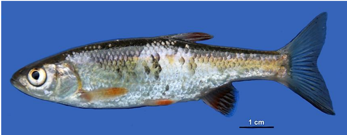
Figure 2. Alburnus qalilus from the Afrin River, the Kilis Province.

terminology of morphological characteristics were based on Krupp (1992). The characteristics were measured to the nearest 0.1 mm using digital calipers.