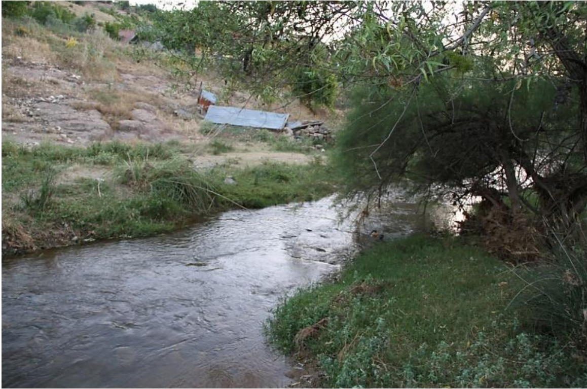
Figure 1. Habitat of Alburnus qalilus in the Orontes river basin, Turkey.