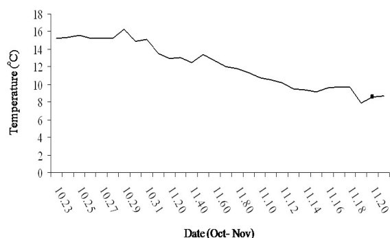
Fig. 1. Daily mean of temperature (°C) of Karaj in long term (Oct- Nov, 1997-2007)