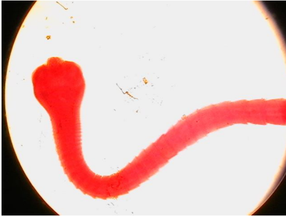
Figure 3: Raillietina Cysticylus in intestine of quails was smeared with Acetocarmen