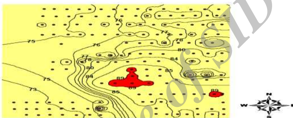
Fig.3: Contours of sound pressure level in packaging unit at the height of measurements by GIS-based software.

With different SPL values. These SPL contours have complex shapes all of which are closed curves. It should be noted that none of the curves has intersected each other because otherwise one point will have two values simultaneously.