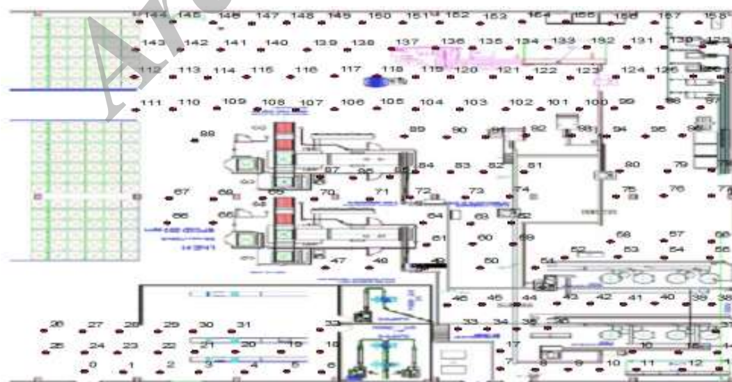
Fig. 1: Lay-out of the plant and the number of measuring point's placement in the package unit.