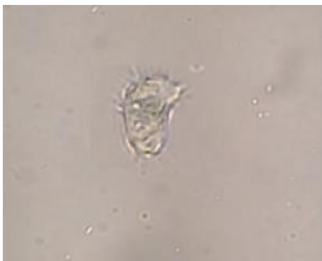
Figure 2: Light microscopy images of Acanthamoeba spp. trophozoite isolated from mucosal tissue of malignant patients in hospitals of Zanjan, Iran Acanthamoeba trophozoite in saline (40X)

Therefore, the presence of Acanthamoeba spp. in various environmental resources should be considered a significant health concern, especially for high-risk populations such as immunocompromised patients and contact lens users [6, 20].