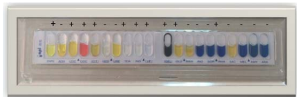
Figure 1) An example of API 20E kit results for V. cholerae strains identification

Biochemical and molecular confirmation of V. cholerae clinical isolates under study: In this study, 20 isolates were examined. According to the API 20E kit software, the existing samples were approved as V. cholerae strains with 99.9% likeness (an example of API 20E kit results and API 20E kit software profiles are shown in Figures 1 and 2, respectively). The results of other supplementary tests are listed in Table 3, including oxidase test, observing movement on a wet slime, the growth on the MacConkey medium, OF glucose test, and the growth on different salt concentrations.