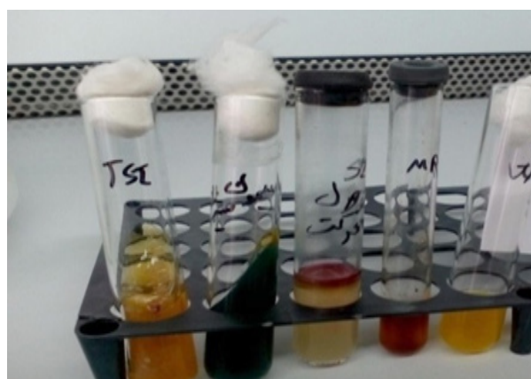
Figure 1) Differential biochemical tests

tract infection, and history of hospitalization in the past month (possibility of nosocomial infection). Out of 105 patients, 26.3% were outpatients, and 73.7% were inpatients. All E. coli strains were isolated from adult women in the age range of 19 to 65 years. Out of 105 samples, 73.5% of the samples were collected from patients with cystitis, and 26.5% were collected from patients with pyelonephritis. The biochemical results are shown in Figure 1.