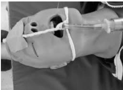
Figure 2: Bandage technique for securing endotracheal tube

study. Informed consent was obtained from the participant relatives.