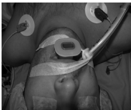
Figure 1: Adhesive tape technique for securing endotracheal tube