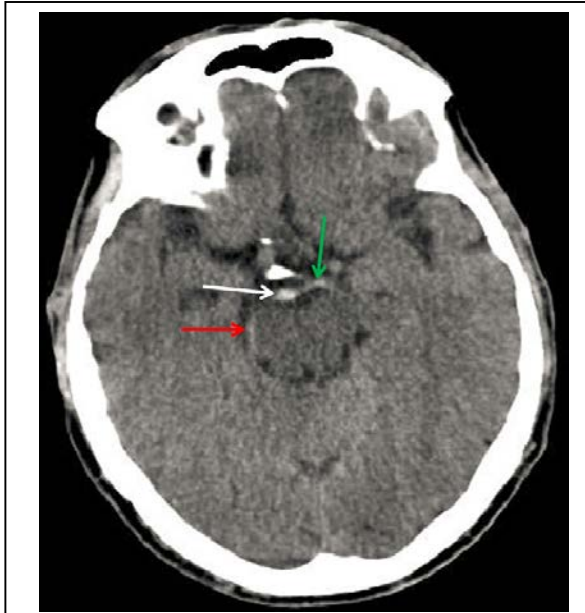
Figure 2: Axial non-enhanced computed tomography of the brain shows a hyperdense basilar artery (white arrow), hyperdense right superior cerebellar artery (red arrow), and a hyperdense left posterior cerebral artery (green arrow) due to intraluminal thrombosis within these arteries.

in every patient with decreased consciousness and signs of brain stem dysfunction until proven otherwise.