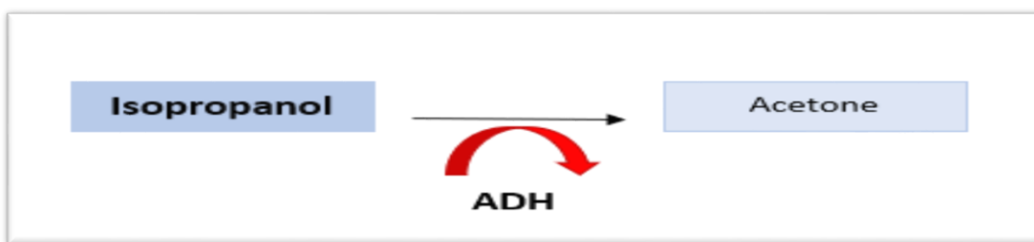
Figure 3: The metabolic pathway of Isopropanol