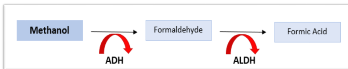
Figure 1: The metabolic pathway of Methanol

Although methanol and ethylene glycol both produce CNS depression, isopropanol generates the most profound degree (1). Isopropanol is rapidly absorbed and inebriates much like ethanol. It is directly converted to acetone by alcohol dehydrogenase, and acetone itself is a CNS depressant that leads to further sedation (Figure 3). Ingestions are sometime due to an attempt by