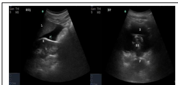
Figure 1: Left image: Bedside Ultrasound of abdomen revealed positive free fluid right upper quadrant. Right image: Bedside Ultrasound of abdomen post catheterization showed catheter bulb in the bladder and irregular bladder wall

unremarkable with no particular urinary symptoms. He is neither smoker nor alcoholic. On examination patient was conscious and oriented;