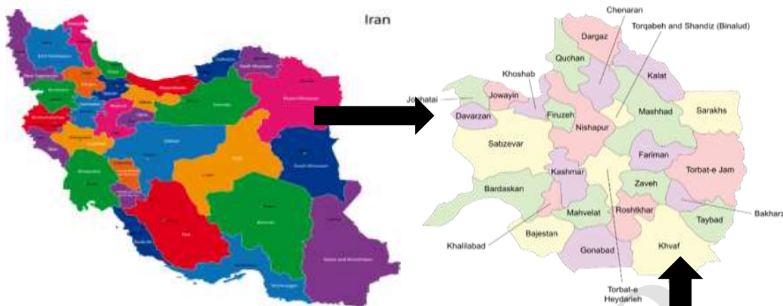
Figure 1. Location of Khorasan Razavi in the map of Iran

The data were entered into the SPSS software (version 23, IBM Corporation, Armonk, NY, USA). Mean and standard deviation (SD) were used for descriptive statistics of the data and chi-square test (or Fisher’s exact test) was conducted for data analysis. P-values < 0.05 were considered to indicate statistical significance.