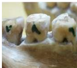
Figure 1-2- infrabony lesion