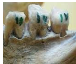
Figure 1-3- infrabony lesion

In order to signify the occlusion surface, an orthodontic wire was used as a marker. For all the lesions, the orthodontic wire was a reference point except for the horizontal lesions, which the reference point was set at the CEJ. The measurements in this study were performed with a modified digital caliper. (Figure 2)