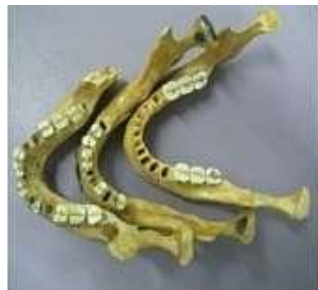
Figure 1-1- dry mandible

ment (n=30), even and uneven craters (n=25), buccal and lingual infra-bony defects (n=17). These defects were formed with 1 and 0.8 fissure burs and ½ and ¼ round burs. (5) (Figure 1)