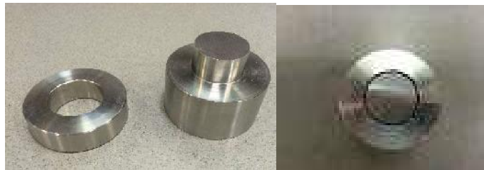
Figure 1. Stainless steel die and impression mold.

This in-vitro experimental study was conducted on 49 casts in 7 groups (n=7). A master model of a stainless steel die (30 mm diameter × 15 mm height) according to ANSI/ADA specification no. 25 (15) was used in this study (Figure 1).