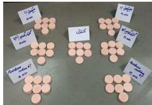
Figure 2. Casts coded in seven groups

The properties of the disinfecting solutions used in this study are presented in Table 2. All impressions were poured with gypsum type IV (100 g of gypsum plus 19-24 ml of water; Snow Rock, Mungyo, Korea; Table 1) after one hour, and the casts were separated from the impressions two hours later (15) (Figure 2).