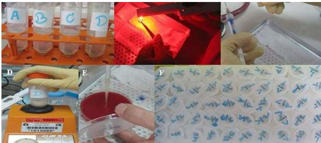
Figure 1. (A) Contamination of the discs with microbial suspensions. (B) Low-level diode laser (FotoSan, CMS Dental APS, Copenhagen, Denmark) at the peak wavelength of 630 nm and maximum output power density of 2000 mW/cm 2 . (C) The application of toluidine blue. (D) Sonication of the specimens. (E) The culture medium. (F) Serial dilution.

After collecting the data, the mean and standard deviation (SD) were calculated. Statistical tests were performed using SPSS 22.0 software (SPSS Inc., Chicago, IL, USA). Because the data did not follow a normal distribution, Kruskal-Wallis test was used for comparison of the variables between the groups. Pairwise comparisons were performed by Mann-Whitney-U test in association with Bonferroni correction. P < 0.05 was considered statistically significant in multiple comparisons. The level of significance in pairwise comparisons was set at 0.05/3 = 0.0166 .