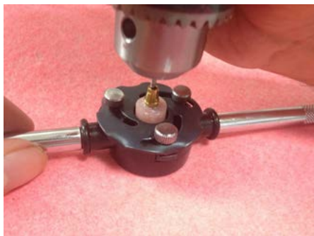
Figure 2. Measuring the removal torque value (RTV) by a torque-meter

The block was fixed by a mounting jig, and then, the abutment screws were torqued to 30 Ncm using a digital torque-meter (TQ-680, Insturthem, Germany) and were tightened to the fixtures. (17) After 10 minutes, the RTV of half of the samples (control group), equally comprising of both internal and external connection types, was measured and recorded. The remaining samples (test group) were subjected to 5,000 thermal cycles between 5-50°C (TC300, Vafaei Industrial, Tehran, Iran). (18) Next, the samples were subjected to cyclic loading (Z030, Zwick, Ulm, Germany) with a 100-N mechanical load at a 1-Hz frequency up to 500,000 cycles (corresponding to 20 months of mastication in the clinical setting). The load was applied to the upper part of the abutments. (15) For this purpose, the implant-abutment assembly was held by a holder and cyclic loads were applied at 23±1°C with 50±5% humidity. (17) Only half of the samples were subjected to cyclic loading. Afterwards, the RTV of each abutment was measured and recorded (Figure 2).