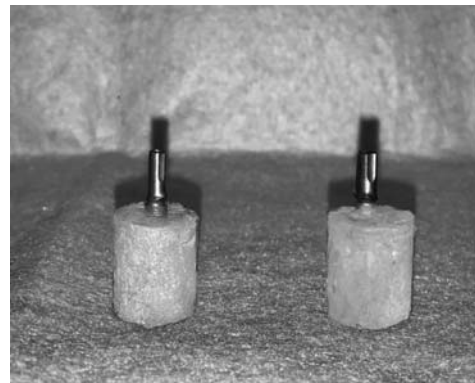
Figure 1: Abutments with two different diameters (3.9 mm and 5.2 mm)

This in-vitro experimental study was conducted on sixteen Morse-taper implants (4×10 mm, Lazak, Prague, Czech Republic) with two different abutment diameters (3.9 and 5.2 mm) and with 3-mm gingival height (Figure 1).