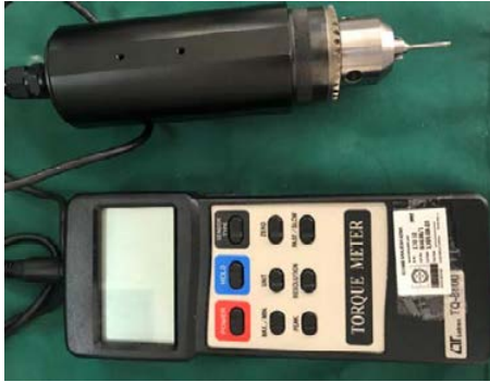
Figure 2: Digital torque meter (Lutron Electronic Enterprise Co. Ltd., Taiwan)

Next, the abutments (3.9 and 5.2 mm) were installed into the implants with a 25-Ncm torque as recommended by the manufacturer. The torque was measured using a digital torque meter (Lutron Electronic Enterprise Co., Ltd., Taiwan; Figure 2).