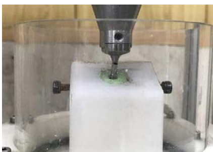
Figure 3: Applying a 75-N force on abutments with 1-Hz frequency at a 30-degree angle

Eight screws in each group were maintained for a month in a stable state while the rest of the screws underwent cyclic loading (Chewing simulator, SD Mechatronic, Feldkirchen, Westerham, Germany) for 10,000 cycles with the frequency of 1 Hz and force of 75 N/cm at a 30-degree angle, which is equal to occlusion loads exerted on a natural tooth for 20 months (Figures 3 and 4).