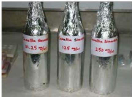
Figure 2. Different concentrations of green tea extract

Three concentrations of 3.125%, 12.5%, and 25% were prepared accordingly (Figure 2).