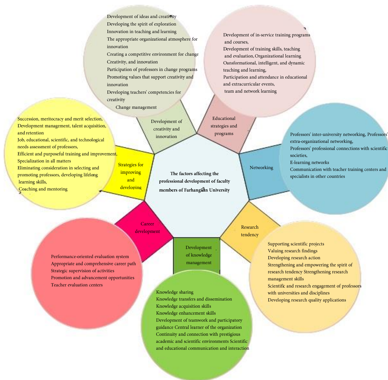
Figure ۳: Graphic chart of factors affecting the professional development of faculty members of Farhangian University