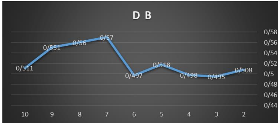
Figure 2. Davis-Boldin index chart.

Given that the minimum value obtained is the optimal number of clusters, then the optimal value for the Davis-Boldin index is number 3. As a result, customers are grouped into 3 clusters.