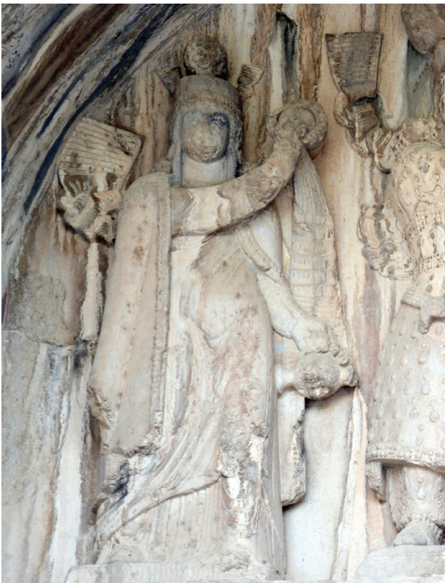
Fig. 7. The Goddess of Anāhitā in the relief of Taq-e Bostan with a crown of pearls along with a jug of water.

such as pearls, water jugs and the crescent moon; the goddess of Mehr/ Mitra, with the symbol of the Sun crown and the lotus icon has been seen in the scene of Ardeshir's coronation given by Ahuramazda with the presence of Mehr in the arch of Bostan (Fig. 8).