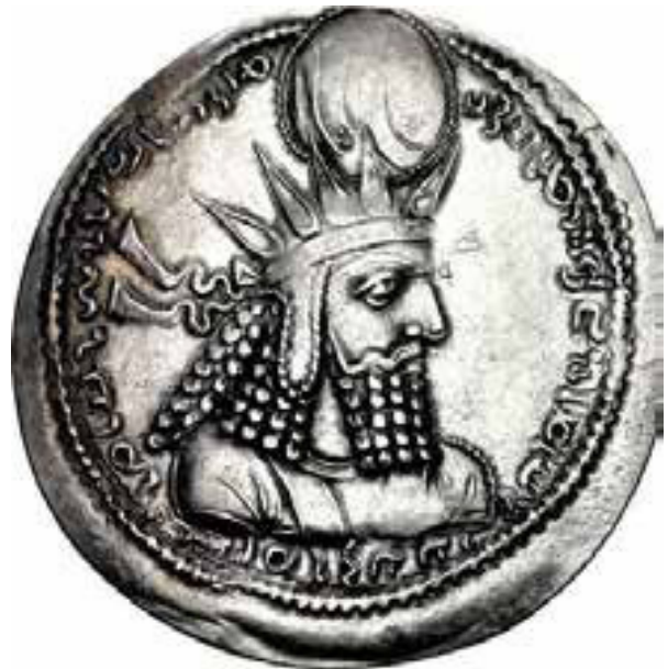
Fig. 5. The Sassanid Coins. Source: Amini, 2006, 254,363.

of Khosrow Parviz near the great lakes, the 'Char Taghi' of Anahita Temple and the other building that is supposed to be related to the Mehr Temple, together make a magnificent complex; another palace has also been located there, later in the Ilkhanate era, which are still remained until today; similar to other buildings of this era, the monument is associated with springs and water, as the building's image is being reflected in the water. The Temple-Cave of Taq-e-Bostan, with magnificent relief locating in the heart of the huge rocks (Fig. 6) is being reflected on a flowing stream arising from a spring. This place is one of the most famous Sassanid campuses/Padis, which is known as Khosrow Parviz hunting ground. The goddess of fertility, Anāhitā, who blesses and protects the flowing waters, has been engraved on the reliefs of the great cave of Taq-e Bostan (Fig. 7), together with the Natural landscapes' symbols