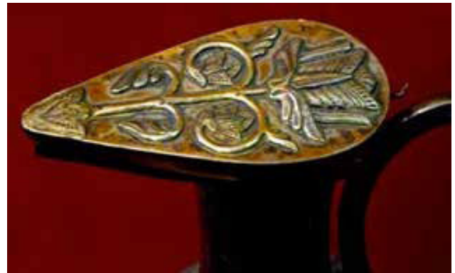
Fig. 2. The ancient dishes belonging to Sassanid Era.

elements like water, mountains, rocks and caves, and the related myths, or the goddess associated with these icons, were highly important to them, all aspects of their lives, culture, and artworks were in connection with the Nature. Water and sky, together with the creatures and animals on earth, from birds like eagles, peacocks, ducks, herons, crows and roosters to the other sacred animals such as cows, goats and snakes, all were related to their beliefs, pointing to the goddess and kings; the king himself was resembling the God's representative and also was being portrayed as a holy person (Fig. 3). The role of lotus' bud and flowers, the sunflowers and the birds such as eagles, peacocks, ducks, herons, crows and roosters can frequently be observed on the brass and cumin trays, showing the birds with strings of pearls on their beaks. These elements and signs are related