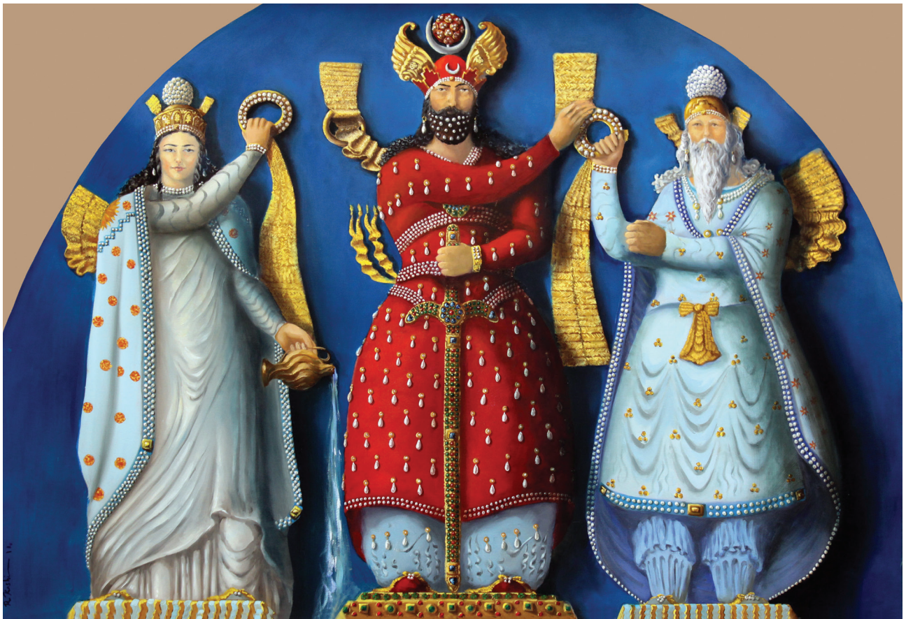
Fig. 9. The clothing designs of Sassanid Kings and goddess.