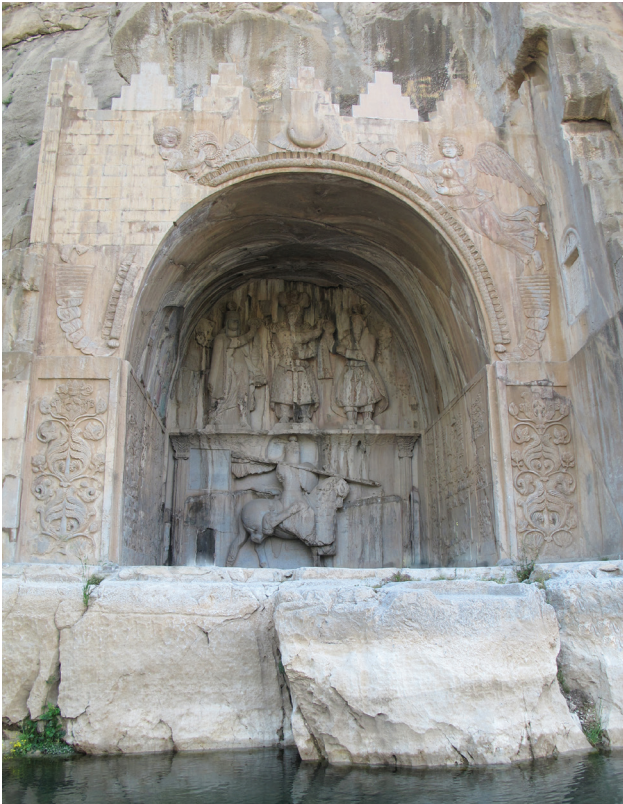
Fig. 6. Taq-e-Bostan.