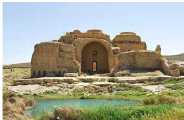
Fig. 1. Ardeshir Palace in Firuzabad. Source: NAZAR Research Center Archive, 2013.