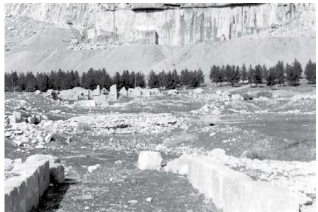
Fig. 11. Farhād Tarāsh on Bisotoun Mountain.