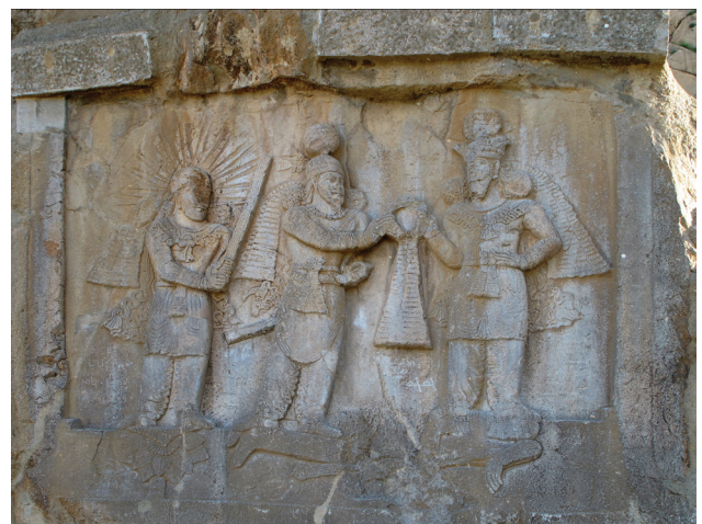
Fig. 8. The coronation of Ardeshir, given by Ahuramazda in the presence of Izad-Mehr, Mitra.

During the past times, a water stream was flowing in this place, and today there is a bath and a mosque near this location, which shows that it has been a cherished place from the past until now; additionally, its nearness to water