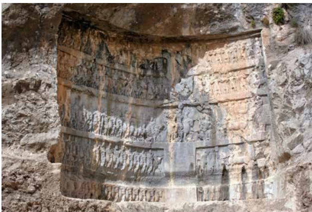
Fig. 10. The relief of Tang-e Chogan.