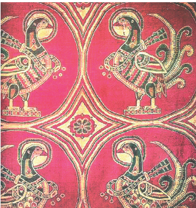
Fig. 4. The role of birds on the fabrics belonging to the Sassanid Era.