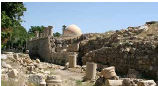
Fig. 12. The Temple of Anāhitā in Kangavar.