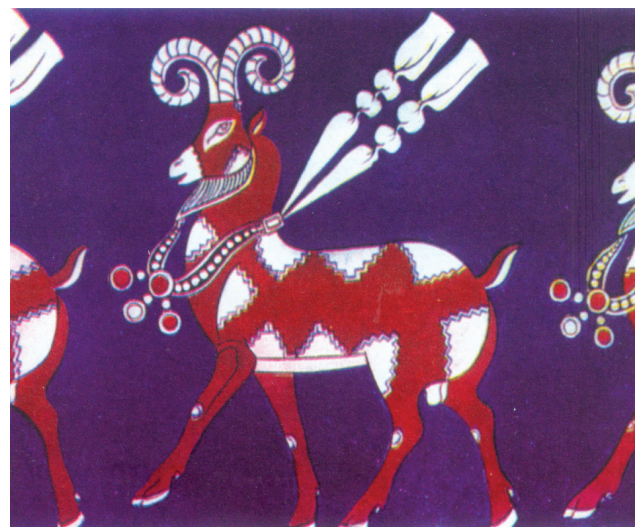
Fig. 3. Horse and goat in motifs from the Sassanid Era.