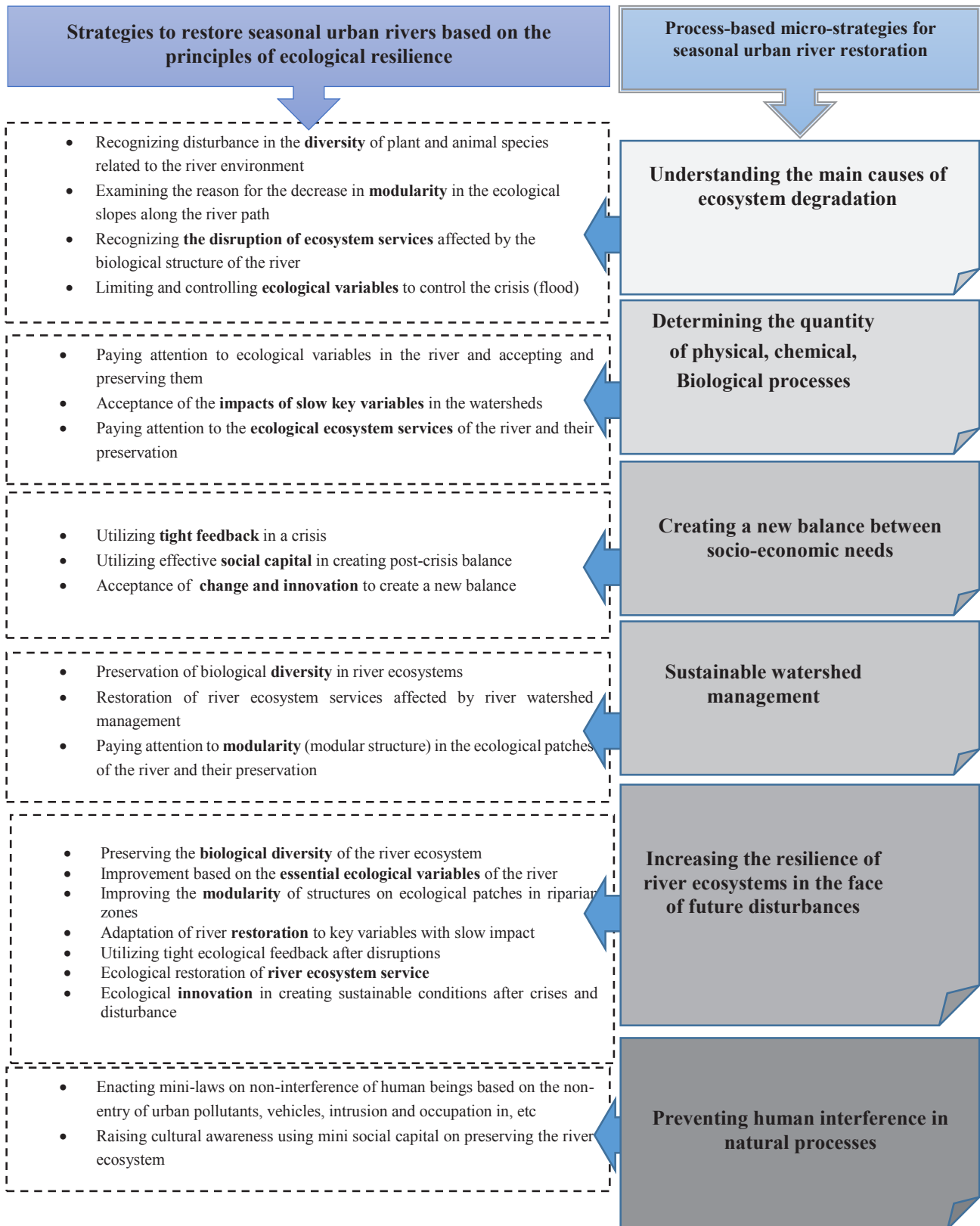
Fig. 5. Strategies of seasonal urban river restoration strategy based on ecological resilience approach.