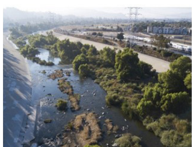
Fig. 3. Right: The Los Angeles River Ecological Rehabilitation 2017, Left: River Restoration.

nature of seasonal rivers and adapting to their nature, instead of confronting them, helps urban planning and design be resilient to nature and achieve a sustainable system after destructive natural events. In cities, human activities affect river systems and take them out of their natural structure (Pedroli, 2014). Ecological resilience is formed first by focusing on the rate of return and rehabilitation of disturbance, and then by emphasizing how a system is rehabilitated. Ecologists always consider a situation of uncertainty and act in such a way that there is always a kind of surprise and unpredictability in the situation and consider resilience in both predictable and unpredictable conditions.