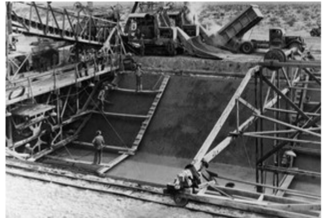
Fig. 2 The Los Angeles River engineering resilience against the 1938 flood (Left) and canalization of the river (Right).