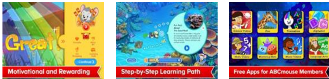
Figure 4. First, second, and third pages of "ABC Mouse" application.

2. "ABC Mouse" Program: This program is an American learning program that includes reading math, art, music, and more for 2- to 8-year-old children, produced in 2014 and supervised by teachers and education experts from "Age of Learning, Inc.". This program has more than 10,000 exciting learning activities for children of all levels of education and has been downloaded more than 10 million times. The figures of the first five pages are presented in Figures 4 & 5. The visual analysis of the pages is provided in Figure 6, and the results of the analysis and data are presented in Table 4.