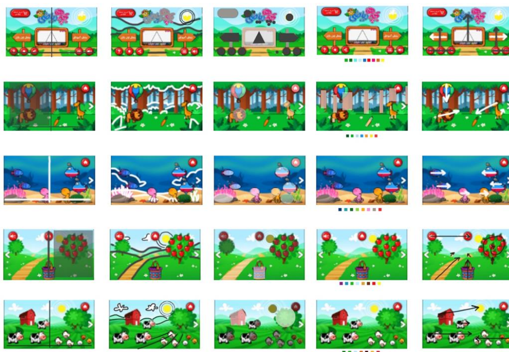
Figure 3. Example of Iranian application analysis: type of lines, shapes, balance and symmetry, harmony, color, direction in line with eye movement.