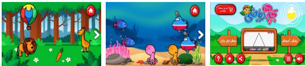
Figure 1. First, second and third pages. Source: Kids Math application. Source: Authors.

1. Review of the Iranian application "Kids Math": The program " Kids Math" was produced by "Armik" company in 2016 and is known as the most popular program among mathematics education programs in Iran, with more than twenty thousand downloads. The program focuses its educational goals on content production for preschool and elementary school. In the following section, the analysis of the elements and qualities used in this program is introduced. In the end, the results are summarized in Table 2. The images and visual analysis of the first five pages are presented in Figures. 1 to 3.