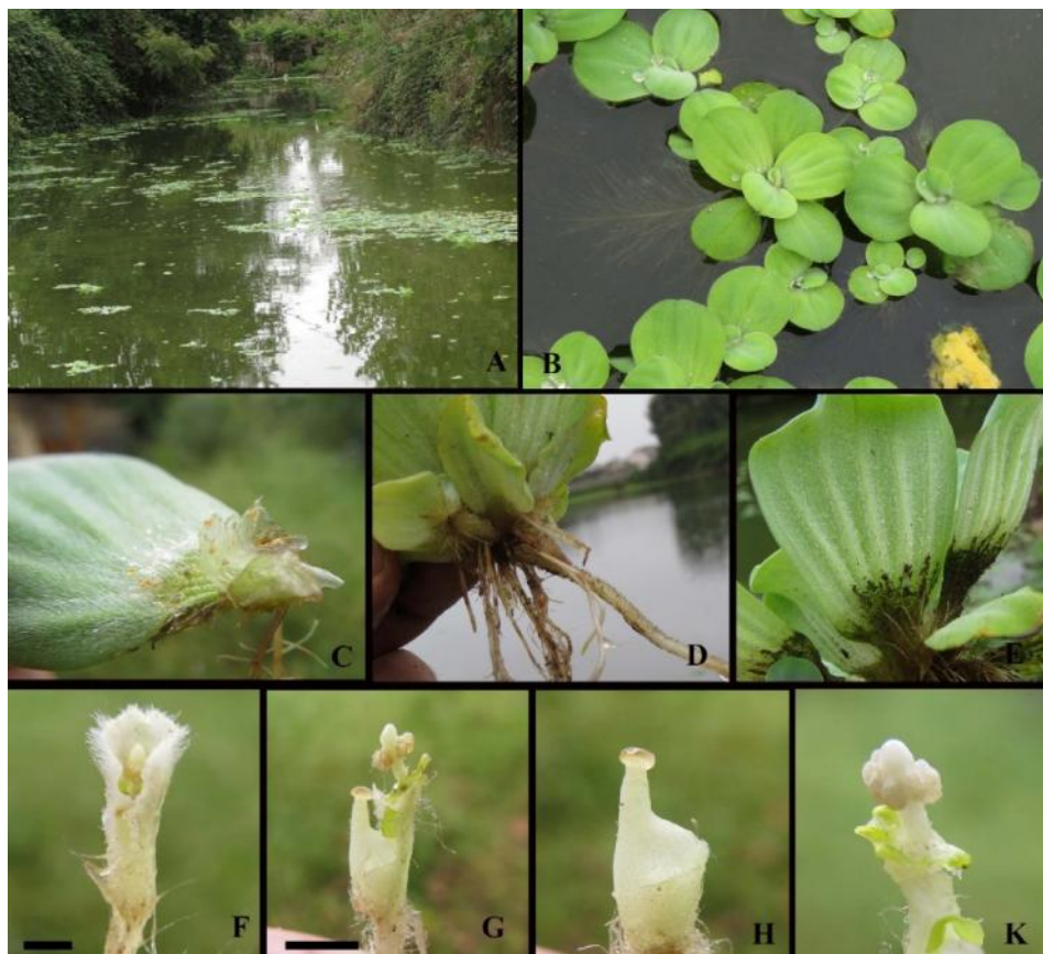
Fig. 2. Pistia stratiotes : A. Habitat, B. Plants, C. Ligule, D. Stolon, E. Leaf in adaxial side, F. Spathe, G. Spadix (male and female flowers along with their position), H. Female flower, K. Male flowers (Bar = 4 mm).