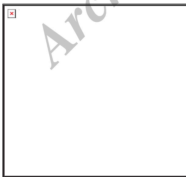
Fig. 1: Piper diagram, showing Dominant water types

The reasons for the development of such harmful bacteria are being in the vicinity of cesspools and accumulation of garbage and landfilling near the utilized wells. Another source which facilitates bacteria growth and groundwater pollution is animal waste materials (manure).