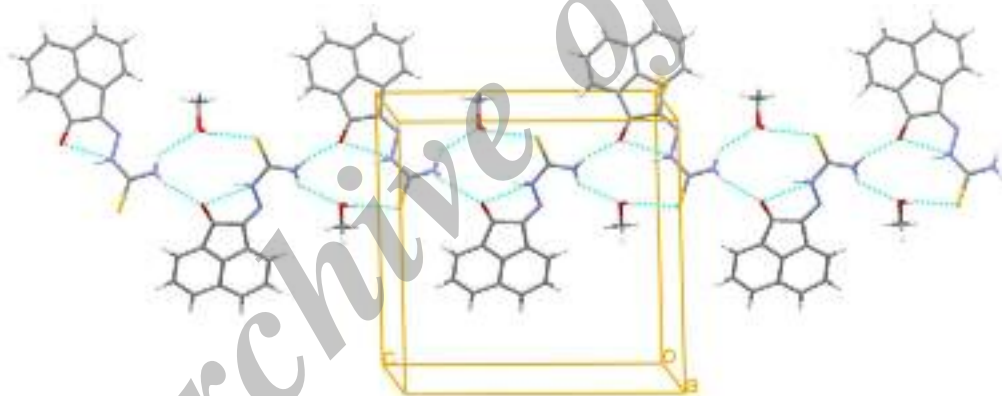
Fig. 2. Packing diagram of 1 . Hydrogen bonds are shown as dashed lines.