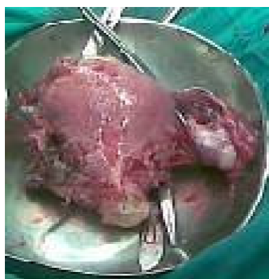
Figure 2. Enlarged uterus, ovarian metastasis, perforation of uterus, and myometrium invasion