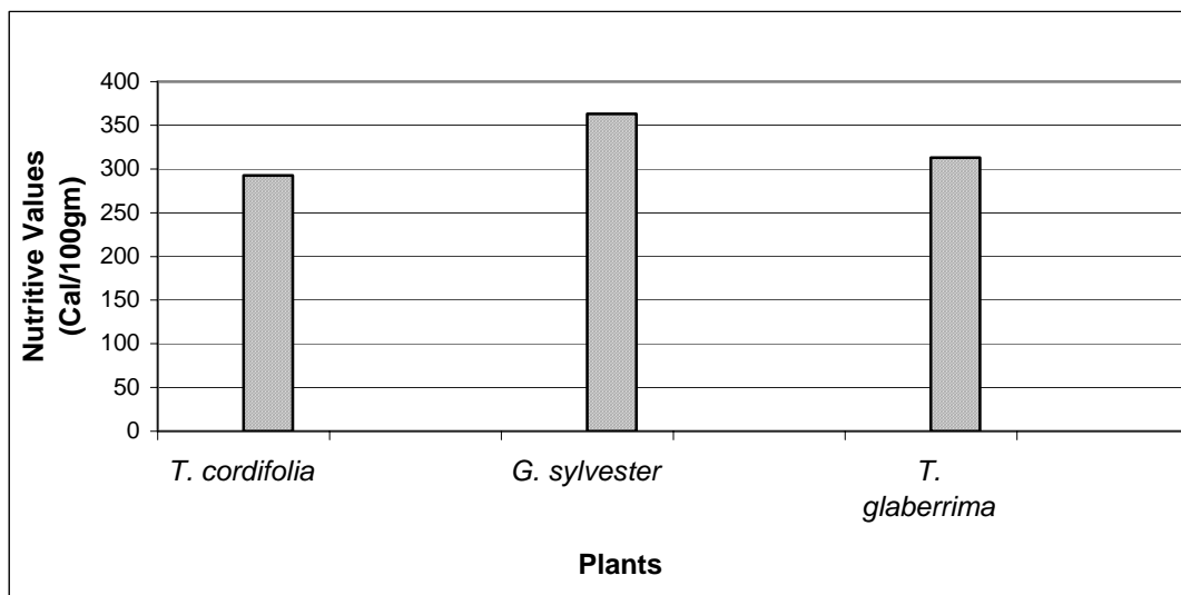
Fig. 3- Evaluation of Nutrient Value

Potassium was higher in all studied medicinal plants but they contained less sodium; Na and K. take part in ionic balance of the human body and maintain tissue excitability, carry normal muscle contraction, help in formation of gastric juice in stomach [34], K help in release of chemicals which acts as nerve impulses, regulate heart rhythms, deficiency causes nervous irritability mental disorientation, low blood sugar, insomnia and coma [35]. Iron sufficient in all studied medicinal plants, it make body tendons and ligaments, certain chemicals of brain are controlled by presence or absence of Iron, it is essential for formation of hemoglobin, carry oxygen around the body [36] Iron deficiency causes anemia, weakness, depression, poor