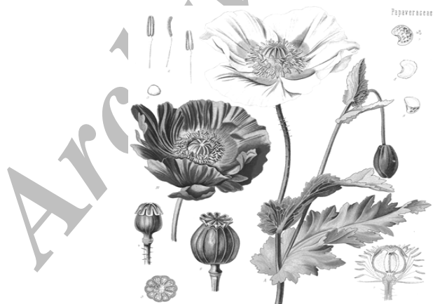
Fig. 1- Opium poppy, P. somniferum and different parts of its vegetative and generative organs [8]

Other alkaloids from poppy species have various uses: noscapine has antitussive and antitumorogenic properties; papaverine is a vasodilator and smooth muscle relaxant; sanguinarine is antimicrobial and anti-inflammatory [5, 7].